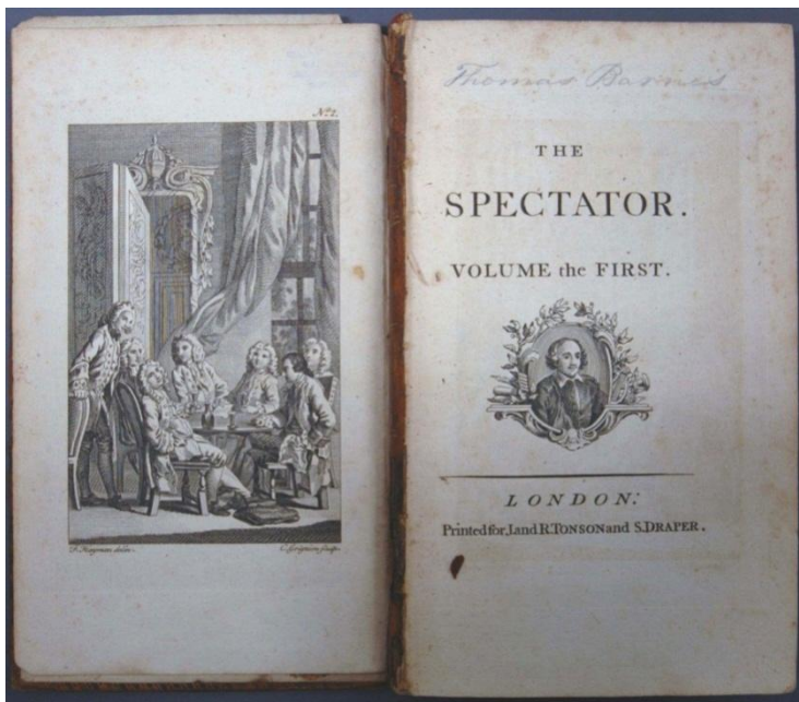
The Cover Page of the Spectator

The Tatler was discontinued in 2 January 1711 made the way for the first issue of The Spectator . The Spectator was published by Joseph Addison and Steele and the first issue was appeared in March 1, 1711. Addison was the main in-charge of the paper. Addison was more concerned to make it a literary magazine and the politics and news were almost ignored.